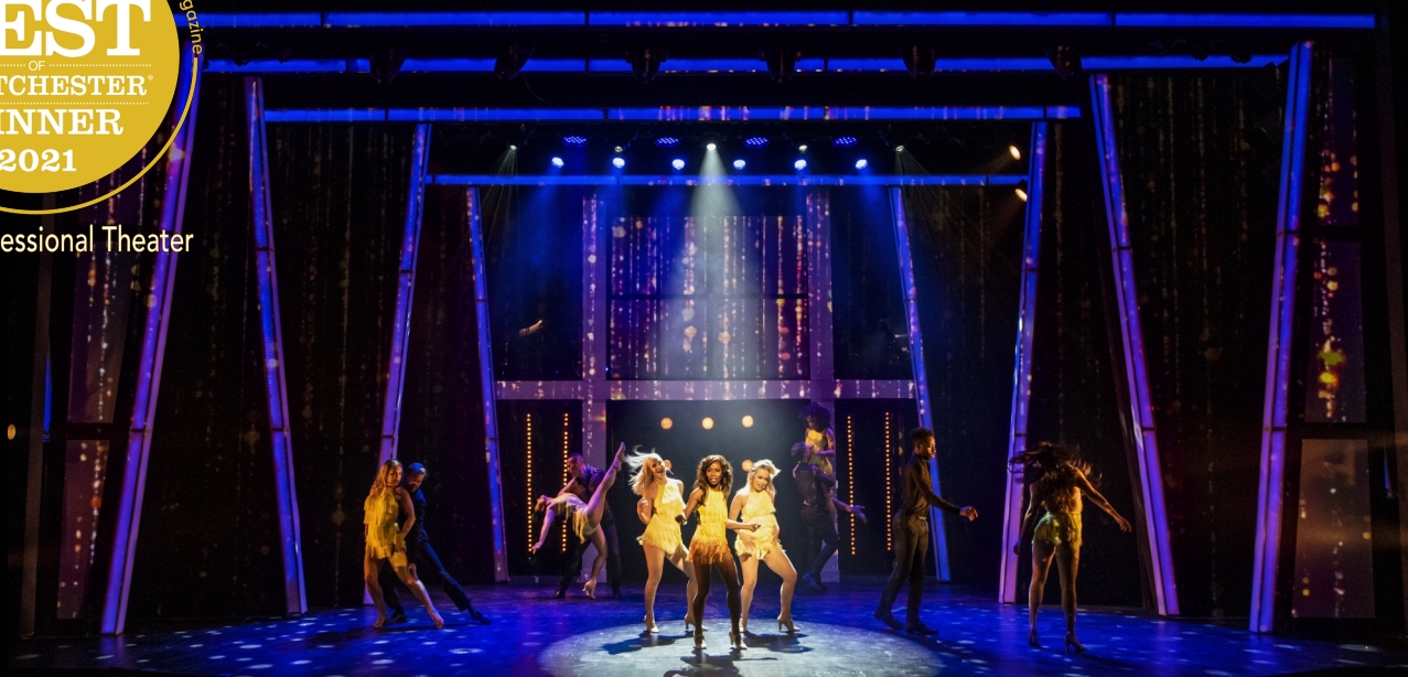
The Bodyguard , April/May 2019